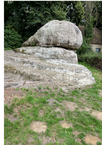
The Chidding Stone