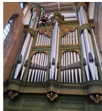
All Saints' organ case