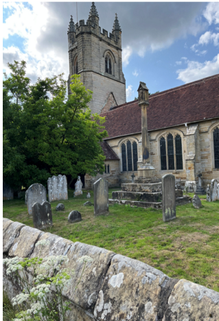
St Mary's church